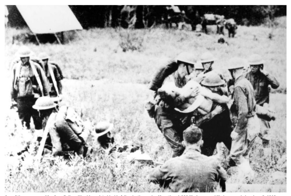
One of the many casualties from Belleau Wood is assisted by his fellow leathernecks. More than 1,000 Marines were killed or wounded on June 6, 1918. LEATHERNECK JUNE 2016 www.mca-marines.org/leatherneck

By late morning, Hill 142 had been neutralized, but the 49th and 67th companies had been decimated, cut down to less than 50 percent effective. Only two officers, Capt Hamilton and 1stLt