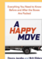
A Happy Move Devra Jacobs & Brit Elders