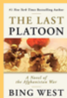
The Last Platoon Bing West

Enjoy your days in the sun and read great material with your Favorite Authors!