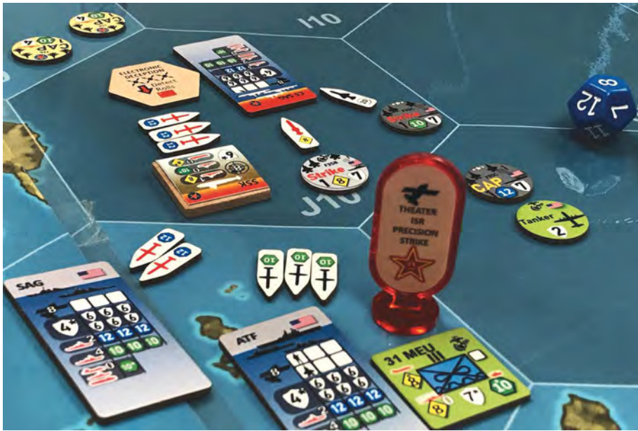
Assassin's Mace.

delivering a body of data that can support quantitative analysis. Once promising ideas emerge from wargaming, they are then injected into more detailed and authoritative government M&S applications like Advanced Framework for Simulation, Integration, and Modeling as well as the Next Generation Threat System for mission and engagement-level analysis that emphasizes operations analysis techniques to identify insights. Together, this blend of wargaming and operations analysis is the optimum approach to provide the information that senior leaders need to make decisions on force design.